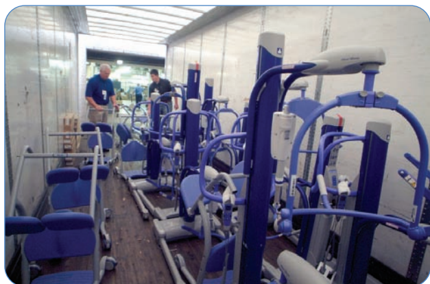
Bart and Ben Youngblood, from manufacturer ArjoHuntleigh of Illinois, help to unload approximately 60 pieces of patient lift equipment from a tractor trailer truck.